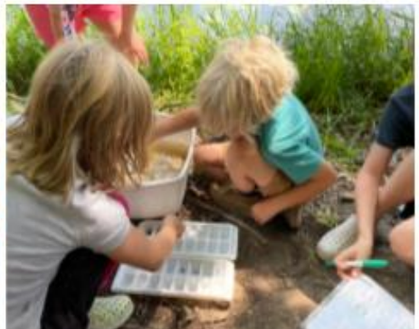
Exploring Nature Campers investigating macroinvertebrates